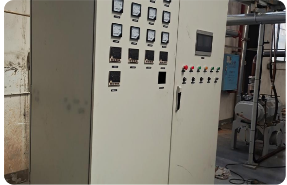
Pressureless Sintering Furnace image 3