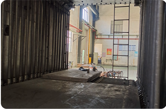
Pressureless Sintering Furnace image 2