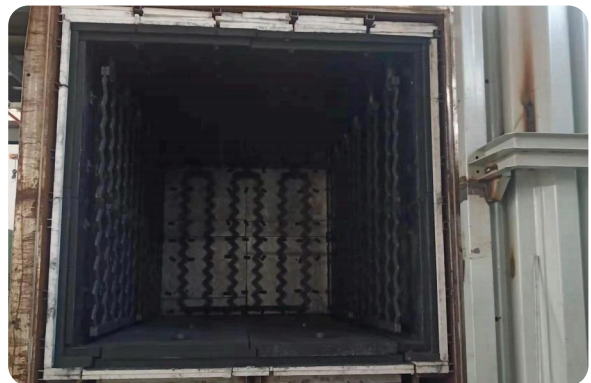
Vacuum High-Temperature Sintering Furnace for Silicon Carbide / Silicon Nitride image 3