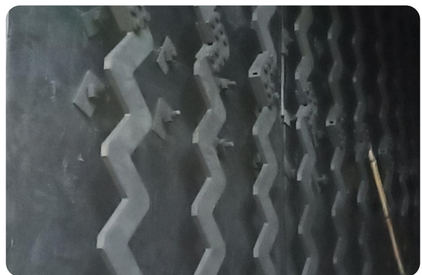
Reaction Sintering Furnace for Silicon Carbide image 3