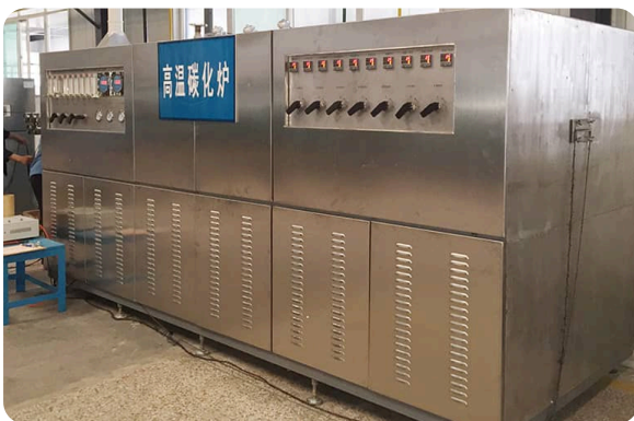
Continuous Carbonization Furnace for Carbon Paper and Carbon Cloth image 2